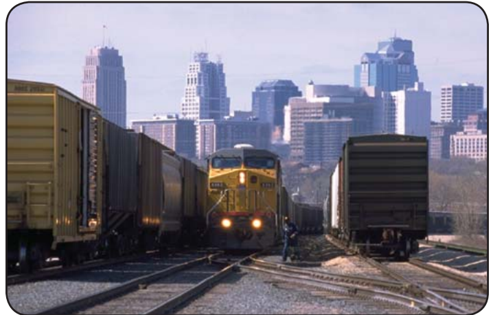
Recently ITTC researchers used a rail car to test technology used for monitoring goods en route. Alerts are sent to authorized individuals if cargo is breached. KU and industry are teaming up to create safe, efficient transportation corridors necessary for the creation of an inland port in Kansas City.